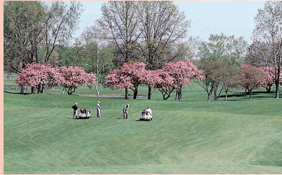
Huron Meadows Metropark Golf Course 8765 Hammel Rd. • Brighton, MI 48116 (800) 477-3193 Toll Free (810) 231-4084 • (734) 426-4711 Fax www.metroparks.com/parks/pk_huron_meadows.php