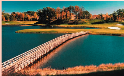
The Jackal at Mt. Brighton* 4141 Bauer Rd. • Brighton, MI 48116 (810) 229-9581 • (810) 229-3077 Fax Website: www.mtbrighton.com