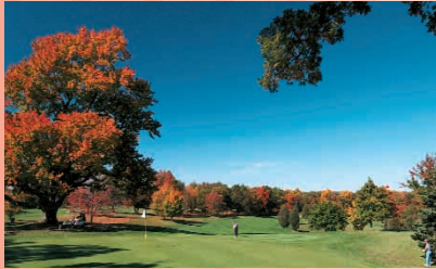
Dunham Hills Golf Club, Inc.* 13561 Dunham Rd. • Hartland, MI 48353 (248) 887-9170 • (248) 887-4965 Fax Website: www.dunhamhills.com