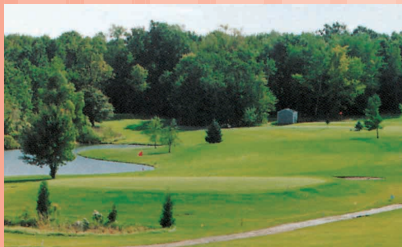
Hawk Meadows at Dama Farms 410 E. Marr Rd. • Howell, MI 48843 (517) 546-4635 • (517) 546-9183 Fax Website: www.hawkmeadows.com