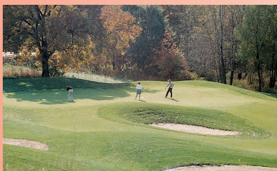
Hunter's Ridge 8101 Byron Rd. • Howell, MI 48843 (517) 545-GOLF • (517) 545-1070 Fax E-mail: hrgolf@ismi.net Website: www.golfhuntersridge.com