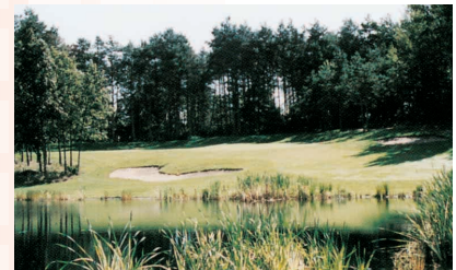
Whispering Pines Golf Club* 2500 Whispering Pines Drive Pinckney, MI 48169 (734) 878-0009 • (734) 878-3317 Fax Website: www.whisperingpinesgc.com