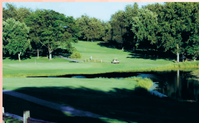
Kensington Metropark Golf Course* 2240 W. Buno • Milford, MI 48380 (248) 685-9332 • (248) 684-5836 Fax (800) 477-3178 Toll Free www.metroparks.com/parks/pk_kensington.php