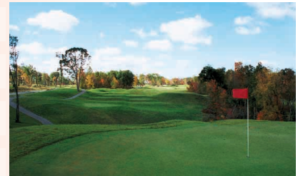
The Preserve Golf Club* 9218 Preserve Dr. • Fenton, MI 48430 (810) 714-3206 • (810) 714-3207 Fax Website: www.thepreserve.org