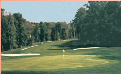
Hartland Glen Golf Club 12400 Highland Rd. • Hartland, MI 48353 (248) 887-3777 • (248) 887-0336 Fax Website: www.hartlandglen.com