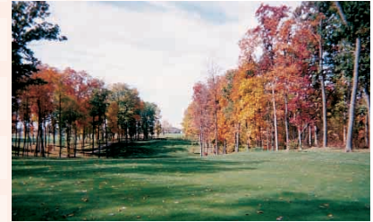
Marion Oaks Golf Club* 2255 Pinckney Rd. • Howell, MI 48843 (517) 548-0050 • (517) 548-1769 Fax